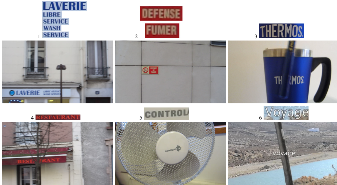
Figure 4: Our challenging video sequences. 1-2: motion blur, 3-4: partial occlusion, 5: rotation, 6: cluttered background. Zoom on text models to track (extracting from the first frame) are given above each frame.