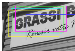
(b) Position of particles and model in the current frame