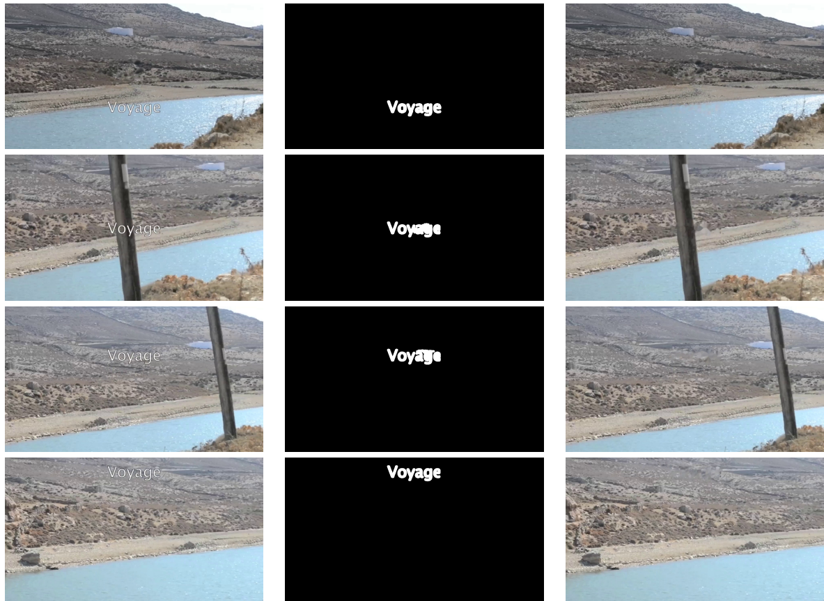
Figure 5: Example of application of our text tracker. First column presents a series of frames (33, 68, 96, 136) with embedded text. Second column gives binarized text area provided by a tracking and binarization process. Third column shows results of “inpainted” frames.